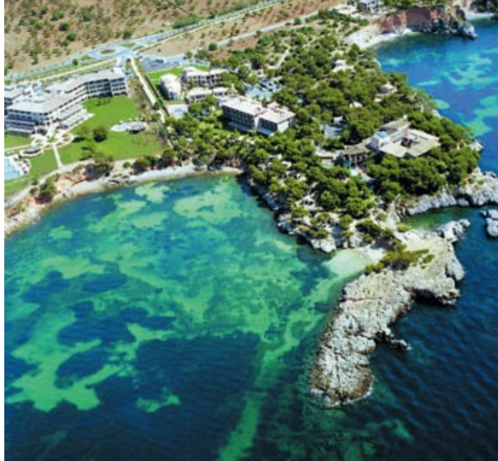
"Hotel Punta Negra Resort" Costa d'en Blanes, Mallorca/Spain